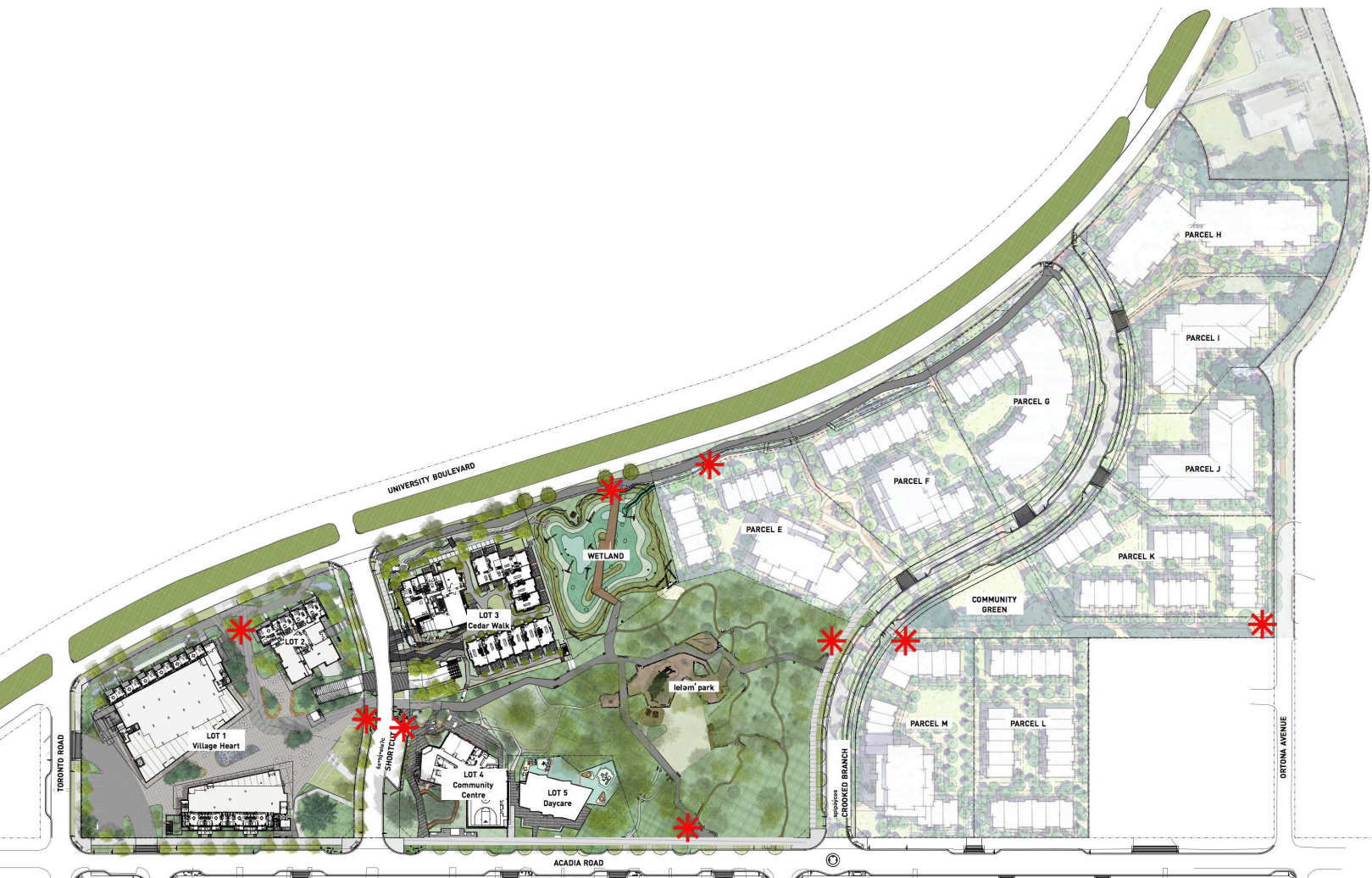
Site plan showing approximate site location for the Lighting Shrouds public art opportunity throughout Phases 1-4