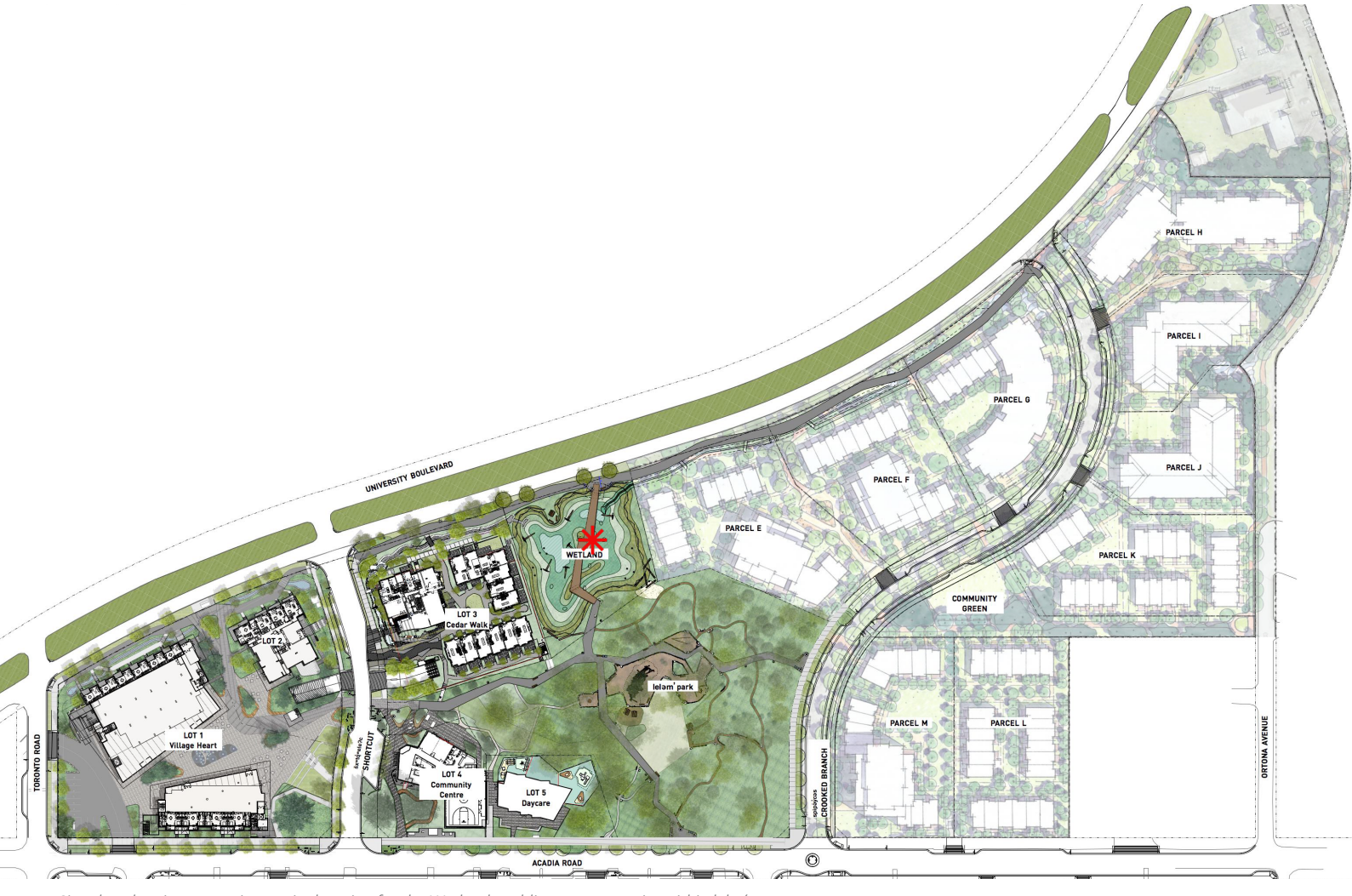
Site plan showing approximate site location for the Wetlands public art opportunity within leləḿ