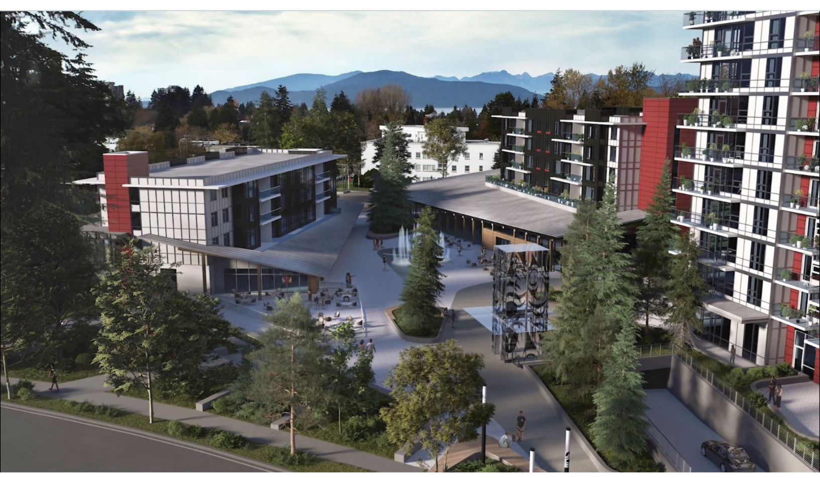
Aerial view of leləm plaza, rendering

Unprecedented in scope and philosophy, leləm is a significant four-phased, 21.44-acre master-planned community within the University Endowment Lands (UEL). Adjacent to the University of British Columbia campus, the development sits to the west of the University Golf Club, fronting University Boulevard. leləm supports a diverse and inclusive mix of housing types, with a total of 1,250 homes for an estimated population of 2,500 residents. Thirty thousand square feet of commercial space add a vibrant mixed-use capability to the development, with a multitude of natural and built amenities on site, including restaurants and retail, as well as a community centre, daycare, and supermarket. The adjacent UBC campus is an historic, established, and robust community offering a wide array of additional amenities. Importantly, leləm is surrounded by 874 hectares of Pacific Spirit Park; hiking and walking trails, as well as nature preserves, cover over 63% of the site. Carefully integrating the development into its natural surroundings, leləm offers a lifestyle that is connected to nature.