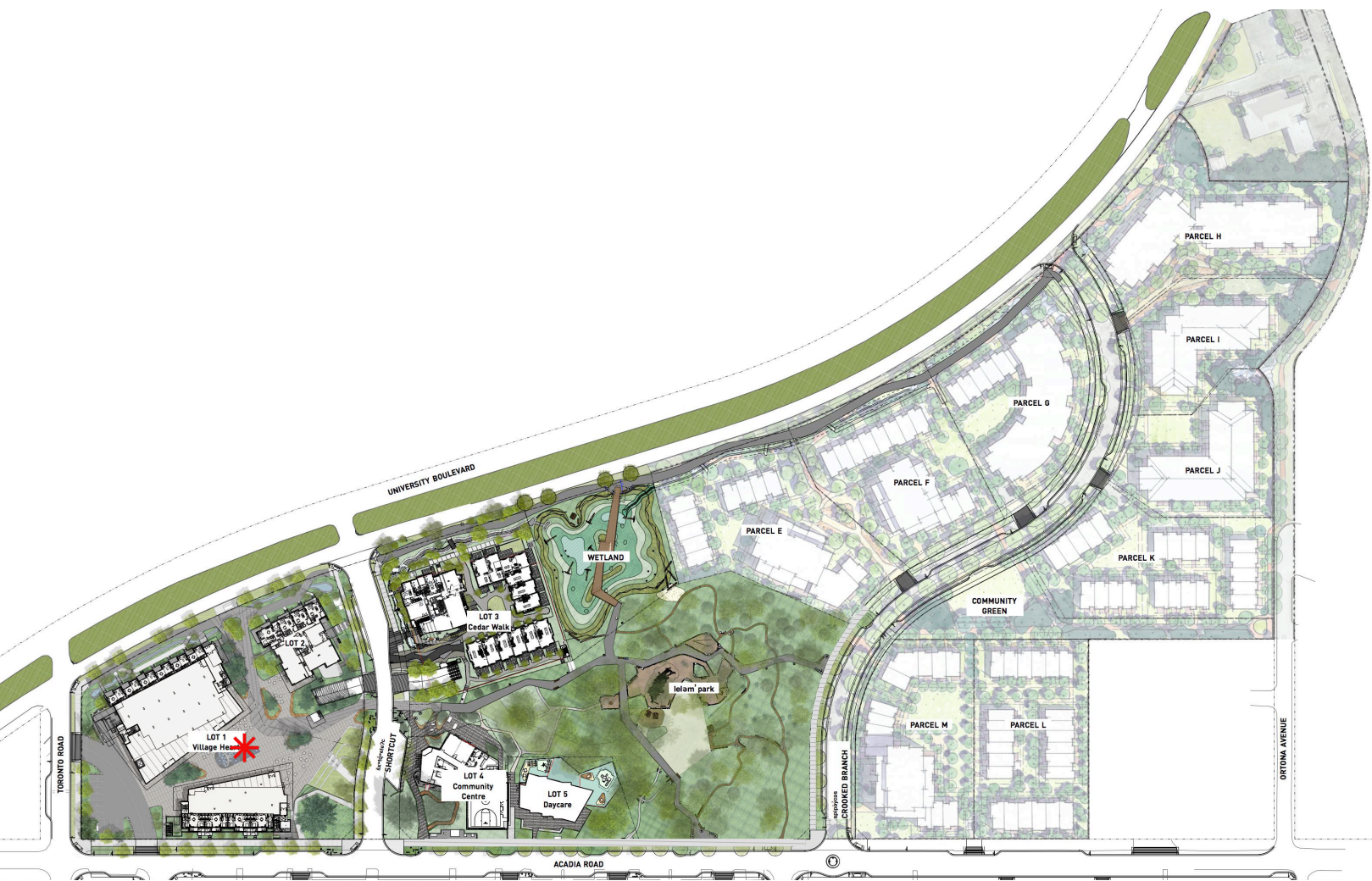
Site plan showing approximate site location for public art opportunity within Ielarn