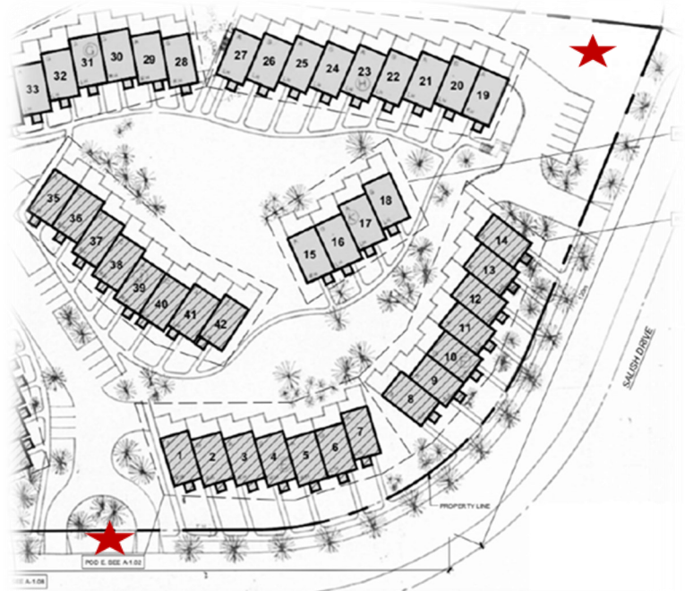
★ Site Plan showing approximate locations of new Shalimar Signage